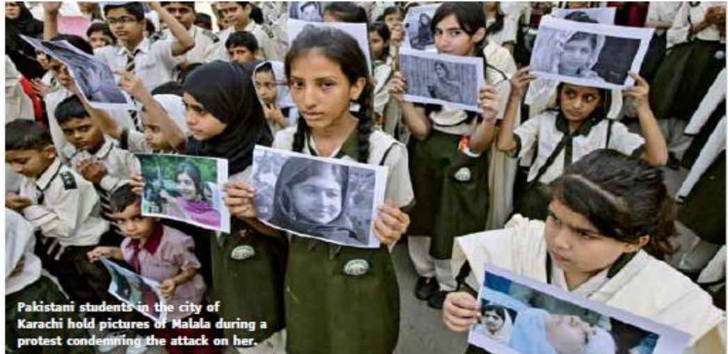
Pakistani students in the city of Karachi hold pictures of Malala during a protest condemning the attack on her.